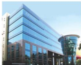
Aclnuti Trade Centre - MIDC, Andheri (E)