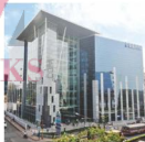
Aclnuti Star - MIDC, Andheri (E)

Hubtown's Premium Commercial Spaces in Andheri (E).