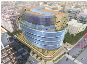
Hubtown Solaris - Andheri (E)

Hubtown's Premium Commercial Spaces in Andheri (E).